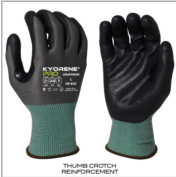
THUMB CROTCH REINFORCEMENT