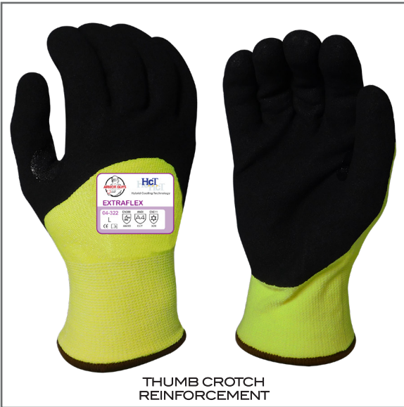
THUMB CROTCH REINFORCEMENT