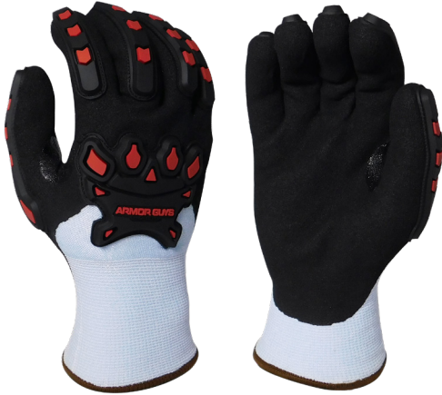
THUMB CROTCH REINFORCEMENT