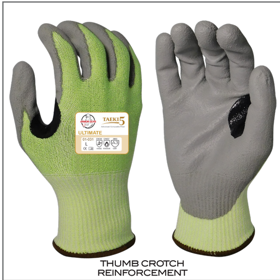
THUMB CROTCH REINFORCEMENT